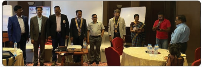
IMA Chennai Villivakkam Ayanavaram Branch