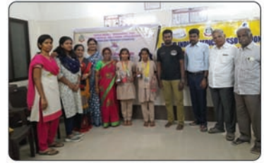
IMA Attur Branch