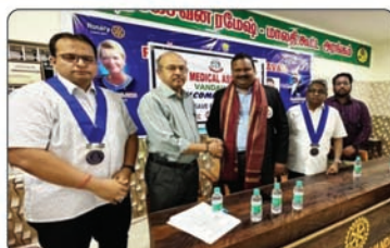
IMA Vandavasi Branch