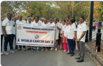
IMA Coimbatore Branch