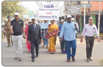
IMA Ambattur Avadi Branch