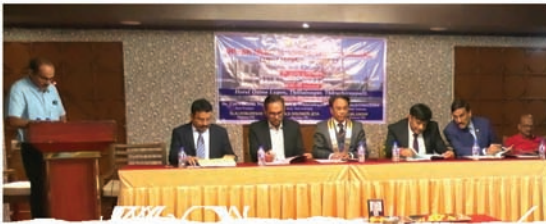
FSS Management Committee Meeting on 12.02.2023 @ Tiruchirapalli