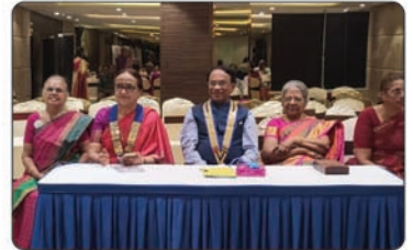
IMA Chennai South Branch