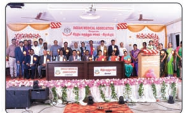
IMA Rasipuram Branch