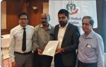
IMA Chennai Kodambakkam Branch