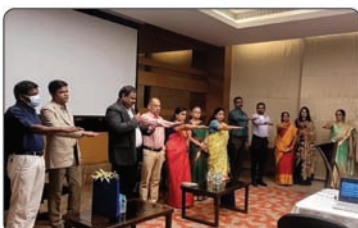
IMA Chennai Velachery Branch