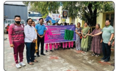
IMA Dindigul Branch