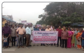
IMA Villupuram Branch