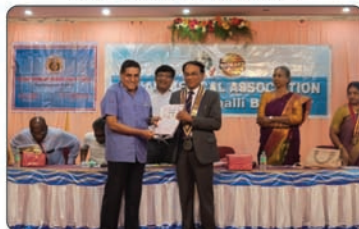
IMA Tiruchirapalli Branch