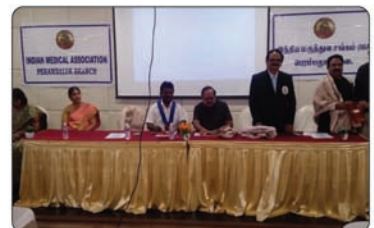
IMA Perambalur Branch