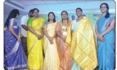
IMA Chennai Tambaram Branch