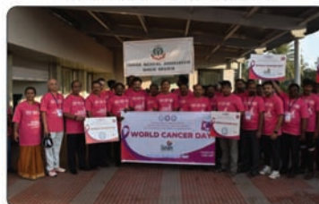
IMA Hosur Branch