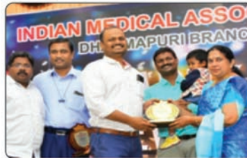
IMA Dharmapuri Branch