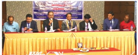
FSS General Body Meeting on 12.02.2023 @ Tiruchirapalli