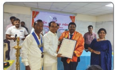
IMA Kanchipuram Branch