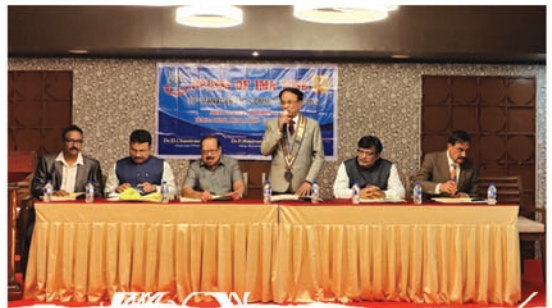
PPLSSS Management Committee Meeting on 11.02.2023 @ Tiruchirapalli