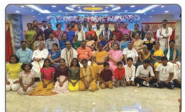
IMA Thiruvallur Branch