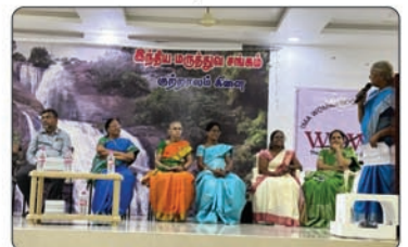
IMA Courtallam Branch