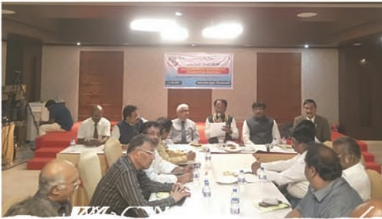
Constitution Amendment Committee Meeting on 11.02.2023 @ Tiruchirapalli

Volume : 24 Issue : 02 February 2023 Rs. 5/-