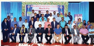
Installation of New Office Bearers of IMA Tirunelveli on 22.01.2023