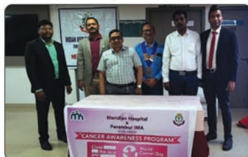
IMA Chennai Perambur Branch