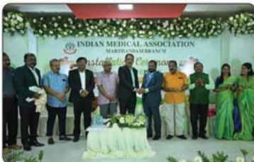
IMA Marthandam Branch