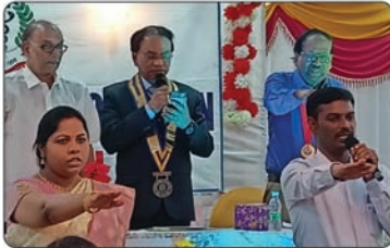
IMA Arni Branch