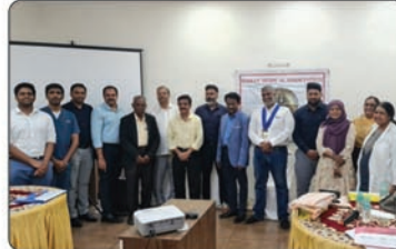
IMA Chennai Purasaiwalkam Branch