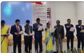
IMA Hosur Branch