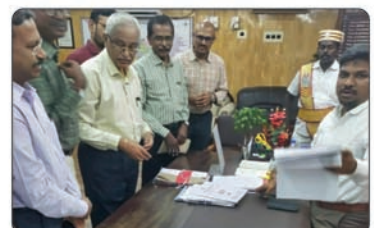
IMA Virudhunagar Branch