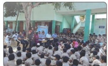
IMA Kallakurichi Branch