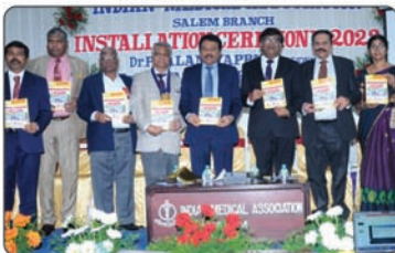
IMA Salem Branch