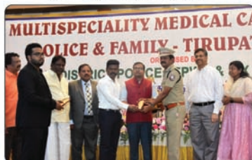
IMA Tirupattur Branch