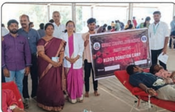
IMA Erode Branch