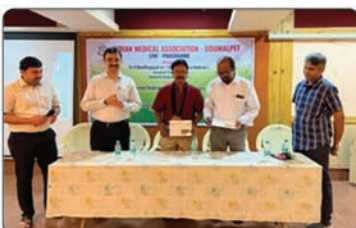
IMA Udumalpet Branch