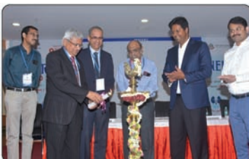
IMA Madurai Meenakshi Branch