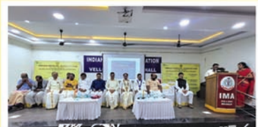
Installation of New Office Bearers of IMA Vellore on 05.02.2023