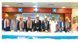
Installation of New Office Bearers of IMA Tuticorin on 27.01.2023