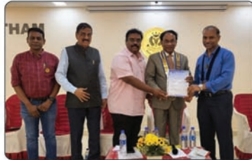
IMA Gudiyatham Branch