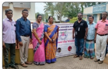
IMA Namakkal Branch