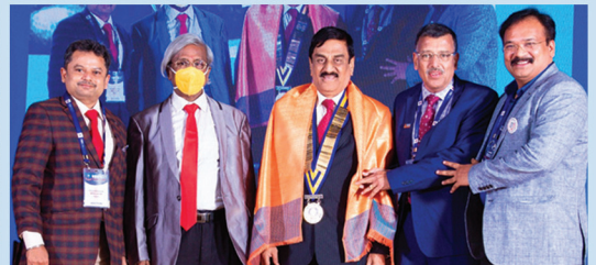
IMA TNSB State Office Bearers Team - 2022