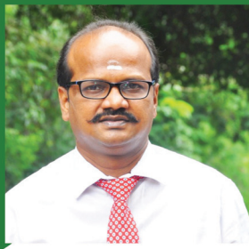
State Finance Secretary Message