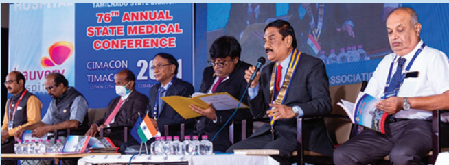
31st State Council Meeting of IMA TNSB at Coimbatore on 12.12.2021