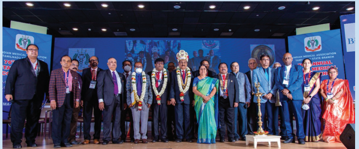
Installation Programme of 68th State President of IMA TNSB at Coimbatore on 11.12.2021